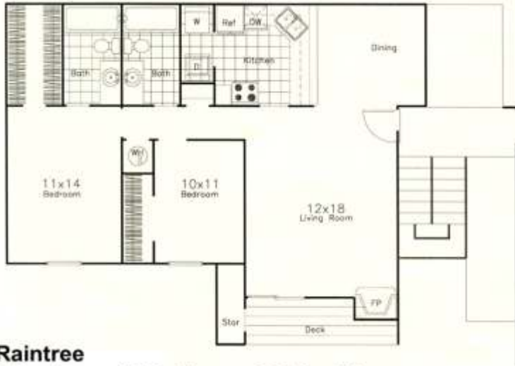
Raintree 2 Bedroom / 2 Bath Approx. 980 Sq. Ft.

Picadilly Square 1926 S. 9th Waco, Texas 76706