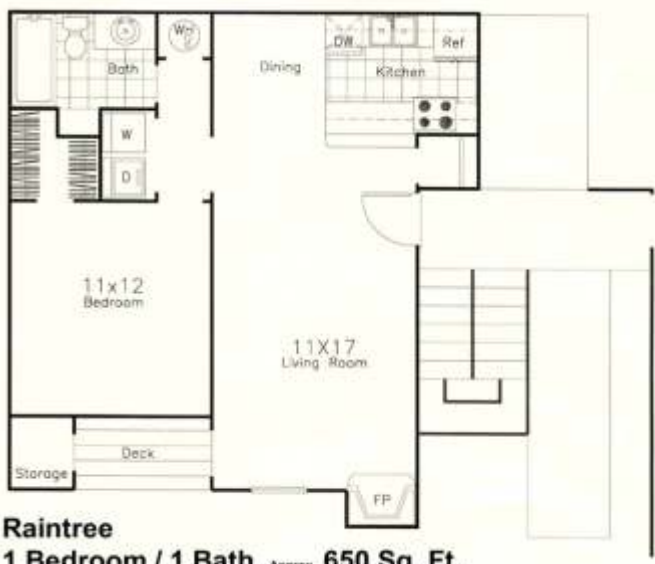
Raintree 1 Bedroom / 1 Bath Approx. 650 Sq. Ft.