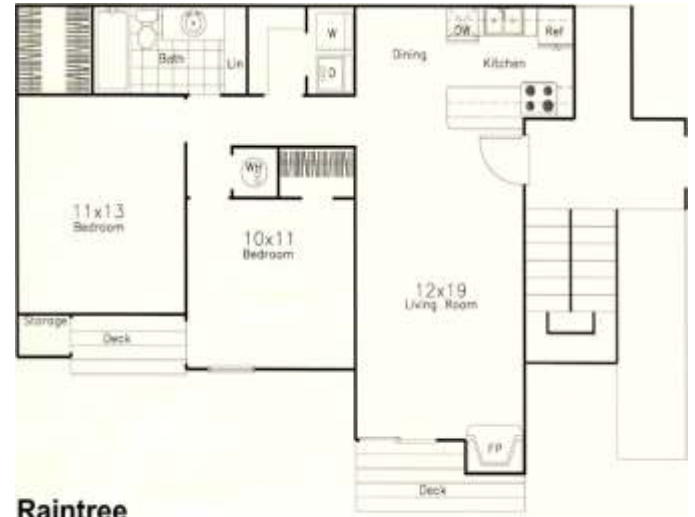
Raintree 2 Bedroom / 1 Bath Approx. 884 Sq. Ft.