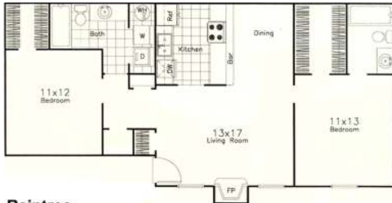
Raintree Split 2 Bedroom / 2 Bath Approx. 980 Sq. Ft.